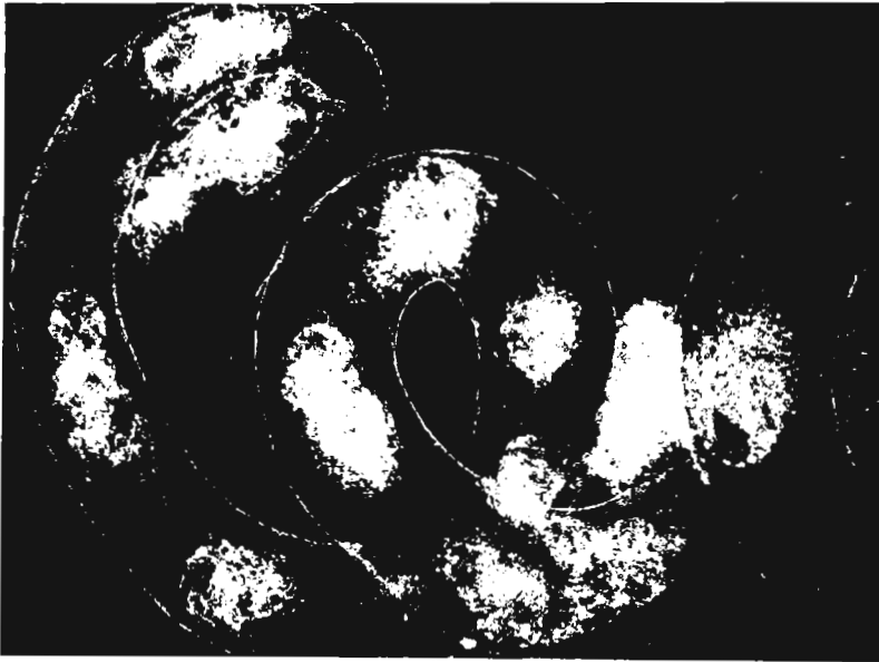
Figure 3. Giant sperm pellets arranged in a single file in the seminal vesicle.