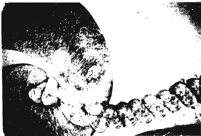
Figure 2. The 'sperm roller' structure localized between the testis (in the left part) and the seminal vesicle (not visible here).

structure seems to consist primarily in disentangling sperm issued from the same cyst, separating and rolling up them individually as a ball in the seminal vesicle. In the latter, the sperm are arranged in a rosary of huge separated monospermatic pellets of 80 \mu m wide (Figure 3) which are offered to females one after another at the rate of about 25 per mating (Joly et al. , 1995; Figure 4). The evolutionary significance of such unique reproductive tractus pattern and way of transferring sperm is controversial. A possibility, given as a working hypothesis, is that it could have some relevance with the multiple-mating behavior prevailing in both D. hydei and D. bifurca . It could for instance be a way to subdivide the